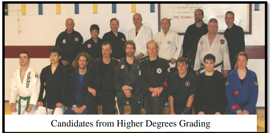
Candidates from Higher Degrees Grading