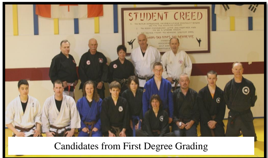
Candidates from First Degree Grading